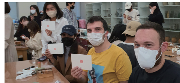
Making a Stamp