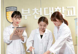
4 th Floor, Yeji Building, Main Campus 032) 610-3440