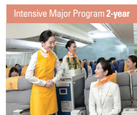
Intensive Major Program 2-year 4 th Floor, Mongdang Memorial Building, Main Campus 032) 610-0840

Certifications Foreign language proficiency certificates, aviation reservation and ticketing, SMAT (Service Management Aptitude Test), CPR certification, Computer Application (Levels 1 and 2), Secretarial Administration (Levels 1 and 2), Craftsman Bartender, etc.