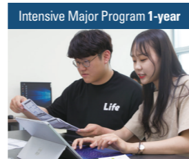
Intensive Major Program 1-year 6 th Floor, Ggumjip, Main Campus 032) 610-3450

Certifications Industrial Engineer Information Processing, Engineer Computer System Application, OCP (Oracle Certified Professional), Electronics related certificates including OCJP (Oracle Certified Java Programmer), MCSE (Microsoft Certified System Engineer), etc. Industrial Engineer Office Automation, Computer Application Level 1 and 2, etc.