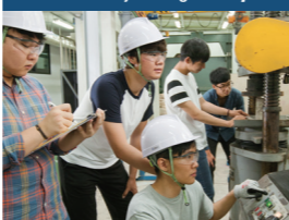
3 rd Floor, Gonghak Building, Main Campus 032) 610-3310