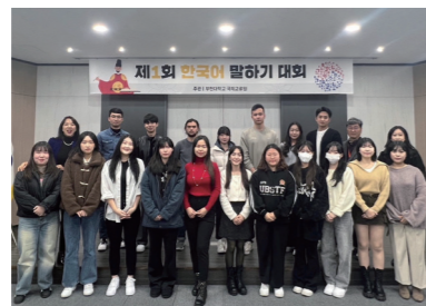
Korean Speech Contest