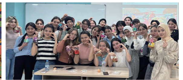
Online Culture Experience (Making an Air Freshener)