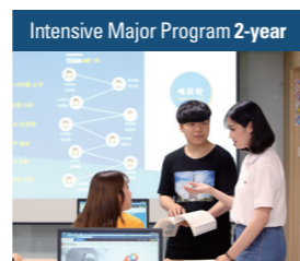
Intensive Major Program 2-year 7 th Floor, Ggumjip, Main Campus 032) 610-3460

Certifications Computer Applications, ADsP (Advanced Data Analytics Semi-Professional), Electronic Commerce Manager, Computerized Accounting, Computer-Aided Tax Accounting, FAT (Financial Accounting Technician), TAT (Tax Accounting Technician), Data Processing Certificate, ERP Information Manager, etc.