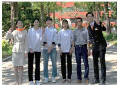
International Student Council