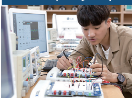
2 nd Floor, Hangil Building, Main Campus 032) 610-3340