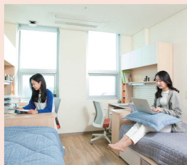
Room for 2