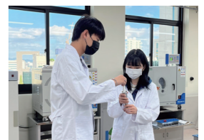
Intensive Major Program 2-year 6 th Floor, Hangil Building, Main Campus 032) 610-3320

Advantages of PPuri Industry Training - Training excellent industry field skills - Acquiring competitiveness in the Korean job market - Learning Korean and culture - Possible to be employed in the area of textile and dyeing processing in Korea