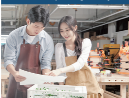
4 th Floor, Gonghak Building, Main Campus 032) 610-3300