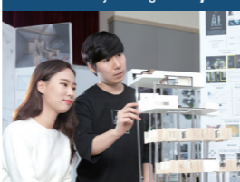
2 nd Floor, Gonghak Building, Main Campus 032) 610-3330