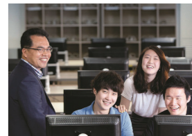
3 rd Floor, Ggumjip, Main Campus 032) 610-3250

Certifications - Computerized Accounting Level 1, Computer-Aided Tax Accounting Level 1/2, Tax Accounting Level 1/2 (State Certified Certification, Korean Association of Certified Public Tax Accountants) - FAT Level 1, TAT Level 1/2 (State Certified Certification, Korean Association of Certified Public Tax Accountants) - Financial Management Level 1 (State Certified Certification, Samil PricewaterhouseCoopers) - CPA, TAX Accountant (National Professional Qualification, Financial Supervisory Service, human Resources Development Service of Korea)