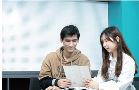
B.G.M.(Bucheon Global Mentoring)