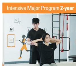
Intensive Major Program 2-year 1 st Floor, Mongdang Memorial Building, Main Campus 032) 610-3490

Certifications Health Exercise Manager, Sports Instructor, Youth Sports Instructor, Senior Sports Instructor, Sports Instructor with Disabilities, Personal Trainer, Rehabilitation Exercise Instructor, First Aid, Sports Massage