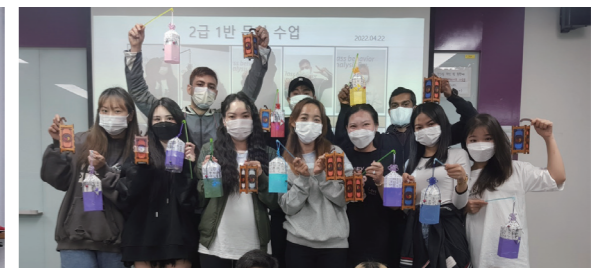
Making a Korean Traditional Lamp