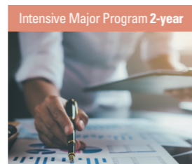
Intensive Major Program 2-year 6 th Floor, Hangil Building, Main Campus 032) 610-3420

Certifications - Management-Related: Certified Management Consultant, Service Management Ability Test, Certified Distribution Manager, Certified Professional Logistician, Certified Vendor, Quality Management, Certified Labor Attorney, ERP, Trade English, etc. - Finance/Accounting-Related: Securities Analyst, Investment Counselor, Financial Planner, Associated Person, CPA, Tax Accountant, Customs Broker, Computerized Accounting, Computer-Aided Tax Accounting, FAT, TAT, Accounting Information, etc. - Computer Systems-Related: Computer Applications, ITQ, MOS, Word Processor, Data Processing Engineer, etc.