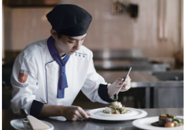
2 nd Floor, Yeji Building, Main Campus 032) 610-0810