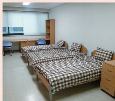
Room for 3