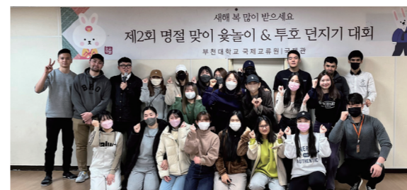
Playing Korean Traditional Games on New Year' Day