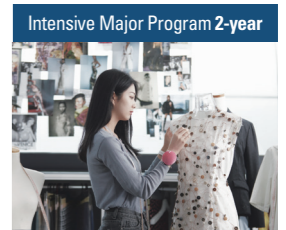
Intensive Major Program 2-year 6 th Floor, Hangil Building, Main Campus 032) 610-3320

Certifications Industrial Engineer Textile, Industrial Engineer Textile Design, Craftsman Textile Printing, Knitwear Design, CAD, GTQ, ITQ, Industrial Engineer Colorist, Shop Master, etc.