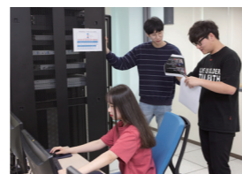
Intensive Major Program 1-year 9 th Floor, Ggumjip, Main Campus 032) 610-3260

Certifications Industrial Engineer Information Security, Industrial Engineer Information Processing, Network controller, Linux Master, Specialist for Information Security (SIS), Certified Information Systems Auditor (CISA), Certified Information System Security Protection (CISSP), Network related certificate like CCNA, CCNP etc.