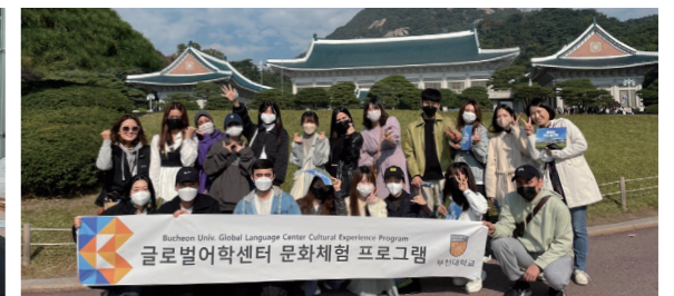
The Blue House Tour