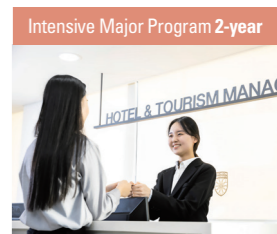
Intensive Major Program 2-year 10 th Floor, Ggumjip, Main Campus 032) 610-3280

Certifications - Tourism: Tourism Interpretation Guide (English, Japanese, Chinese), Aviation reservation and ticketing certification, Tour conductor, Domestic tour guide etc. - Hotel FnB Service: Hotel Manager Certificate, Hotel Service Provider Certificate, Craftsman Bartender, Barista, etc. - Office Automation: Computer Application, Word Processor, Computerized Tax Accountant, etc.