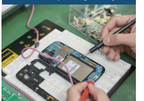
12 th Floor, Ggumjip, Main Campus 032) 610-3360