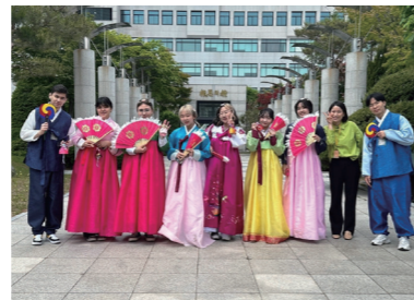
Korean Culture Experience