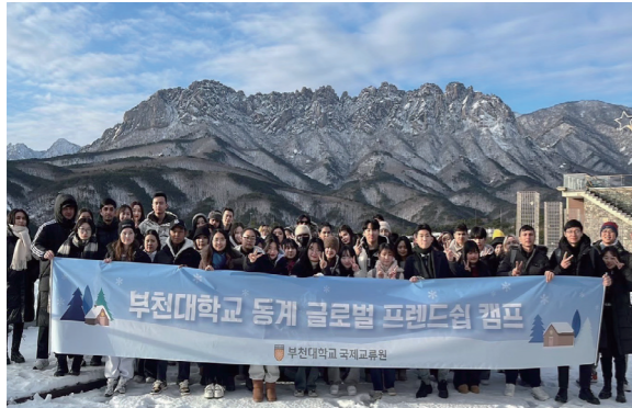
Global Friendship Camp

There are various culture experiences and classes for international students.