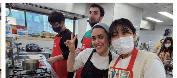
Cooking Korean Traditional Food (Rice-Cake Soup and Sanjeok)