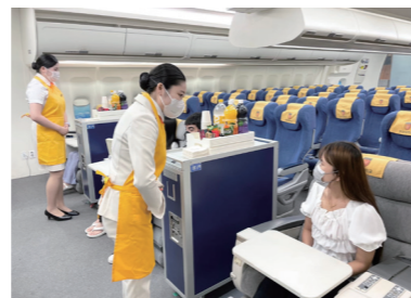
Department Experience Program