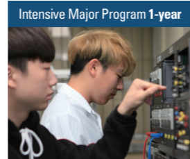
Intensive Major Program 1-year 4 th Floor, Hangil Building, Main Campus 032) 610-3400

Certifications - Industrial Engineer Electricity, Industrial Engineer Electric Work, Industrial Engineer Electric Railway, Industrial Engineer Fire Fighting Facilities, Industrial Engineer Industrial Safety etc. - Possible to take a test of Engineer when entering the bachelor's degree course