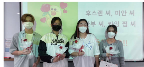
Coming-of-Age Day in Korea