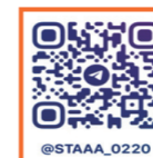
Telegram (Uzbekistan, Russia)