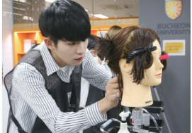
4 th Floor, Millenium Building, Main Campus 032) 610-0660