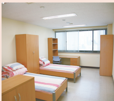
Room for 2