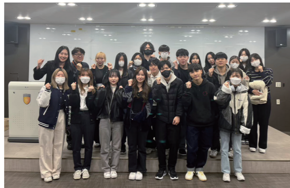
Language Exchange Study (English, Chinese, Japanese)