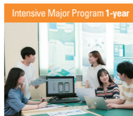
Intensive Major Program 1-year 5 th Floor, Hangil Building, Main Campus 032) 610-3380

Certifications Craftsman Computer Graphics Operation, Industrial Engineer Visual Communication Design, Craftsman Web Design, Engineer Colorist, Industrial Engineer Colorist, ACA, GTQ photoshop, GTQi (Illustration), GTQid (InDesign) etc.