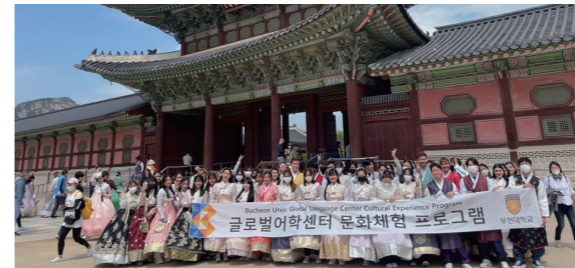
Gyungbok Palace Habok Experience