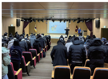
Job Interview Consulting and Supporting Program for International Students