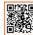
Homepage of Institute of International Affairs