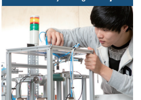
2 nd Floor, Hangil Building, Main Campus 032) 610-3340