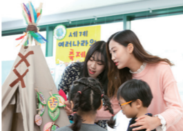
4 th Floor, Mongdang Memorial Building, Main Campus 032) 610-0822