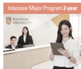
Intensive Major Program 2-year 5 th Floor, Ggumjip, Main Campus 032) 610-3430

Certifications Secretarial Administration, TOEIC, TOEIC Speaking, HSK, Word processor, Computer Application, MOS, ITQ, IT PLUS, Computerized Accounting, Computer-Aided Tax Accounting, FAT, TAT, ERP, SMAT etc.