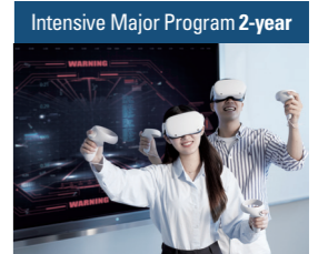
Intensive Major Program 2-year 4 th Floor, Hangil Building, Main Campus 032) 610-3470, 3474

Certifications GTQ (Graphic Technology Qualification), GTQi (Graphic Technology Qualification Illustration)